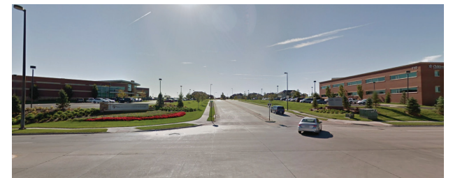
As you enter 175th Street from Burke Street, Building 111 is to your left.

Radiology Lower level Coffee Cart Lower level