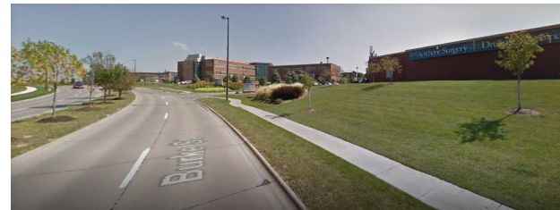
Note that you may only access this entrance driving east on Burke St.

Entrance A Aesthetic Surgery and Dreams MedSpa entrance Level one