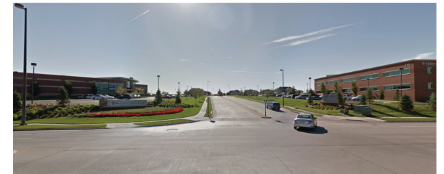
As you enter 175th Street from Burke Street, Building 110 is to your right.

Entrance E ENT, Allergy and Audiology Level two Facial Plastic and Reconstructive Surgery Level two Truhlsen Eye Institute and the Optical Shop Level two Multispecialty Clinic, including: General Surgery, Olson Center for Women's Health, Primary Care, Psychiatry and Rheumatology Level two